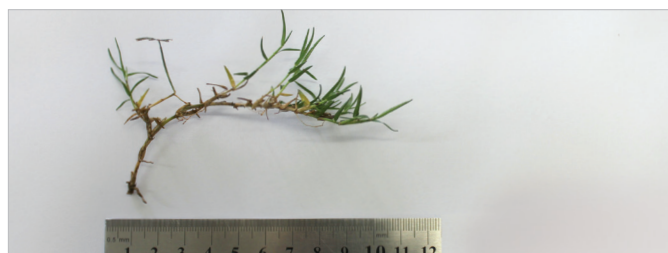
Fig 3. close-up of live stolon