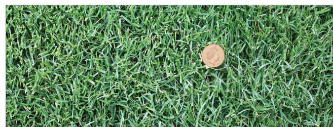
$2 coin on wide shot of grassed area.