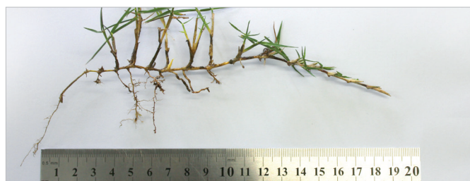
Close-up of live stolon.